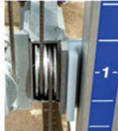
Lift corners are made from UHMW plastic for smooth operation.